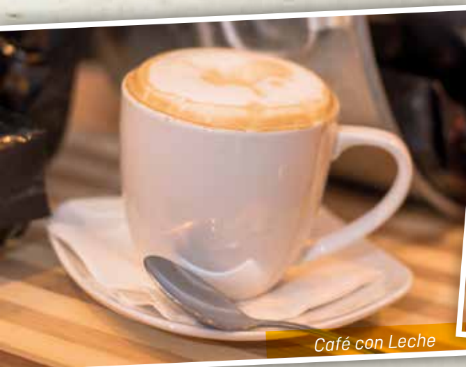
Café con Leche