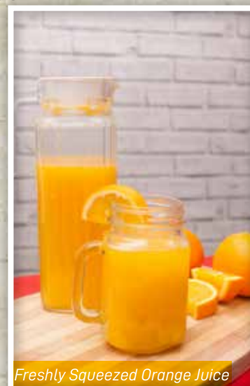
Freshly Squeezed Orange Juice