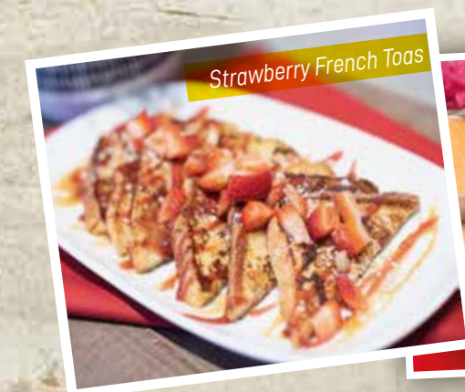
Strawberry French Toast

Four corn tortillas stuffed with Honduran omelette egg, refried beans, sweet plantains, Honduran cheese and chicharron. $8.25