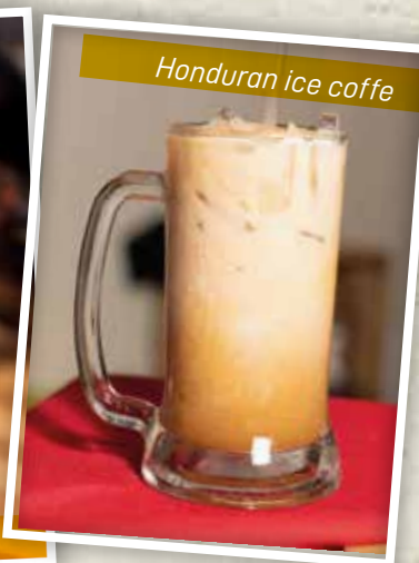
Honduran ice coffe