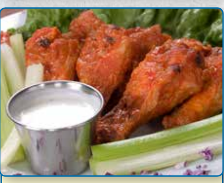
Mexican Buffalo Chicken Wings

Ground beef, melted cheese and pico de gallo – 5.55